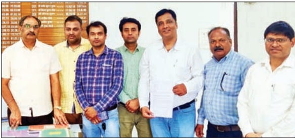
अपनी मांगों को लेकर मुलाकात के लिए पहुंचे बीएड शिक्षक