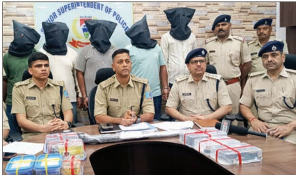
प्रेस कांफ्रेंस कर जानकारी देते एसएसपी व अन्य