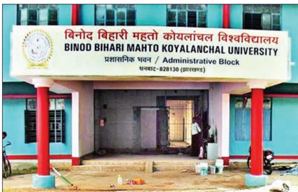
अब तक 11,485 ने जमा की राशि

PHOTON NEWS DHANBAD: स्नातक शैक्षणिक सत्र 2024-25 में नामांकन के लिए पूरे झारखंड के कालेजों में नामांकन की प्रक्रिया चल रही है। नामांकन के लिए इच्छुक छात्र-छात्राओं को चांसलर पोर्टल के माध्यम से आवेदन करना है। गत चार मई से चांसलर पोर्टल खुल चुका है। अब तक राज्य के विभिन्न विश्वविद्यालयों के अधीन कालेजों में 24,542 आवेदन हो चुके हैं। सबसे अधिक 13,492 आवेदन बिनोद बिहारी महतो कोयलांचल विश्वविद्यालय (बीबीएमकेयू) के कालेजों के लिए हुआ है। वहीं, सबसे कम 400 आवेदन डॉ. श्यामा प्रसाद मुखर्जी विश्वविद्यालय रांची के लिए दिया गया है। बीबीएमकेयू में आवेदन करने की अंतिम तिथि 25 मई निर्धारित है।