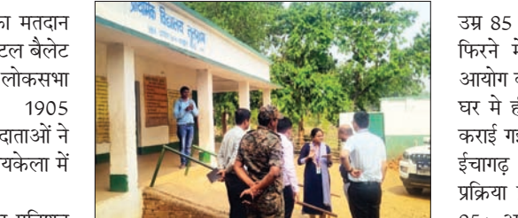
निरीक्षण करते पदाधिकारी

SARAIKELA : रांची लोकसभा का मतदान 25 मई को होना है, जिसके लिए पोस्टल बैलेट से मतदान की प्रक्रिया शुरू है। रांची लोकसभा निर्वाचन क्षेत्र में प्रतिनियुक्त 1905 मतदानकर्मियों ने पहले दिन 244 मतदाताओं ने एनआर प्लस टू उच्च विद्यालय, सरायकेला में पोस्टल बैलेट से मतदान किया। सरायकेला-खरसावां जिले में शत-प्रतिशत मतदान कराने को लेकर रांची लोकसभा संसदीय निर्वाचन क्षेत्र के लिए होम वॉटिंग की प्रक्रिया प्रारंभ हो चुकी है। ज्ञात हो कि रांची