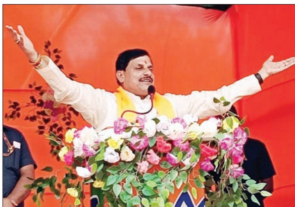
सभा को संबोधित करते डॉ. मोहन यादव

दिनों में फिर से नरेन्द्र मोदी सत्ता में पहुंचेंगे तो देश को सर्वोच्च स्थान तक ले जाएंगे। उन्होंने कहा कि अब तक सरकार की ओर से कश्मीर में अनुच्छेद 370 हटाने के बाद विकास और सामाजिक न्याय बढ़ा है। कश्मीर में चुनाव के दौरान स्थानीय लोगों ने देश के लोकतंत्र की मजबूती के लिए वोट दिया। उन्होंने कहा कि राम मंदिर मिल गया, अब कृष्ण मंदिर की बारी है। उन्होंने कहा कि झारखंड राज्य सरकार ने नौकरियों को बेचने का काम किया है। यह झारखंड के लिए दुर्भाग्य है कि