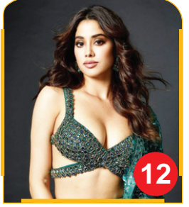
Janhvi Kapoor Paps Have Fun...