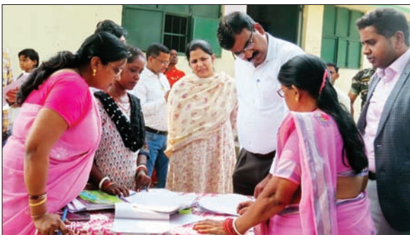
निरीक्षण करते मुख्य चुनाव पदाधिकारी व जिला निर्वाचन पदाधिकारी • फोटोन न्यूज

मुख्य निर्वाचन पदाधिकारी ने धनबाद के कम मतदान वाले पोलिंग बूथों का किया निरीक्षण