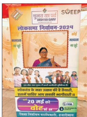
मतदाताओं से अपील करते हुए कहा कि सभी मतदाता अपने मताधिकार का प्रयोग कर पाए, इसके लिए चुनाव आयोग ने हर उचित व्यवस्था की है। अतः हजारीबाग, कोडरमा एवं चतरा के सभी मतदाता 20 मई को मताधिकार का प्रयोग अवश्य करें। आयुक्त ने उन सभी कर्मचारियों का आभासी धन्यवाद किया, जो इस चुनाव प्रक्रिया में सक्रिय भूमिका निभा रहे हैं और लोगों को उनके मताधिकारों का उपयोग करने में सहायता प्रदान कर रहे हैं।