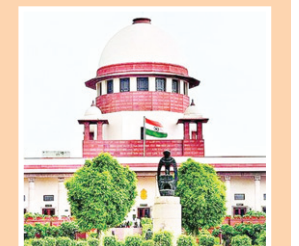
गिरफ्तारी पर 3 टिप्पणियां