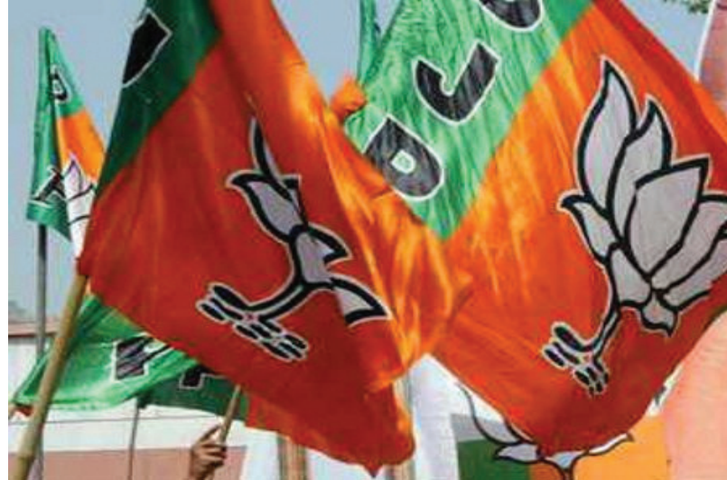
in BJP-ruled Haryana, which resorted to a heavy-handed

Farmers from the state had launched the Dilli Chalo agitation earlier this year, seeking a legal guarantee for the minimum support price (MSP). However, they were prevented from reaching the Capital by the authorities