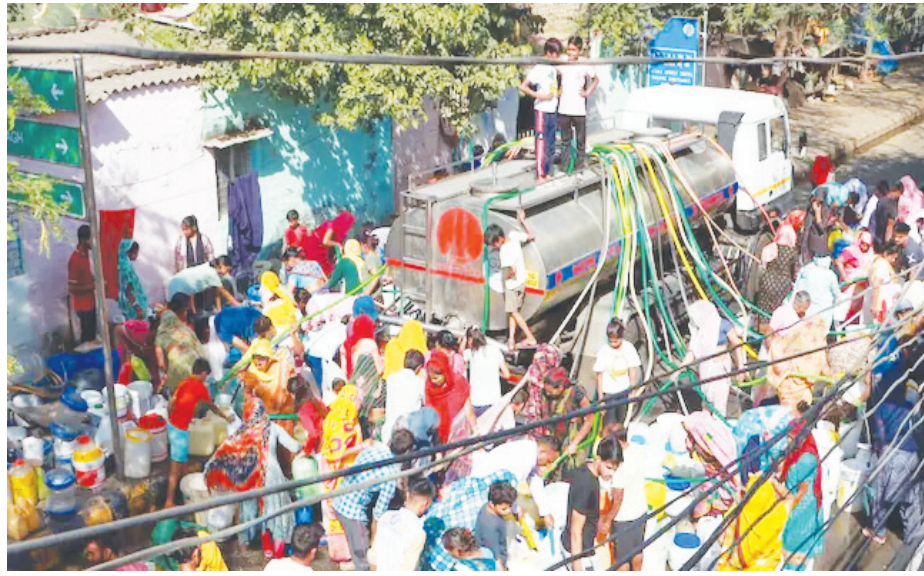
Saxena for blaming Delhi's AAP government for non-maintenance of water canals and theft of water supply. Tuesday's episode of the 'water war' broke after Mr Saxena's social media post, which said he had spoken to Haryana Chief Minister Nayab Singh Saini and received assurances his government had released

court seeking directions to Haryana to release its share of water - has been told to file an affidavit by Thursday. The BJP has accused the AAP of "lying" and fomenting the crisis by mishandling resources and demanded answers from its two most prominent faces - Atishi and Saurabh Bhardwaj. The AAP, meanwhile, has counter-attacked by alleging the BJP government in Haryana continues to not release the city's share of water despite claiming to do so, and has also fired shots at the Lt Governor. On Tuesday Atishi, once again accused the Haryana government of deliberately and illegally halting the water supply to the national capital. Citing an affidavit submitted by the Haryana government to the court, she said, "The Haryana government has been lying about releasing adequate water. Their affidavit presents data on actual discharge of water... which has exposed their lie." She also slammed Delhi Lieutenant Governor VK