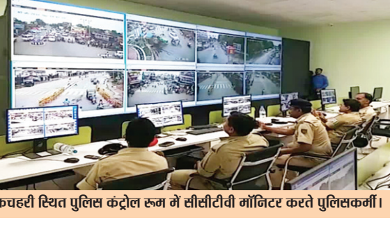
कचहरी स्थित पुलिस कंट्रोल रूम में सीसीटीवी मॉनिटर करते पुलिसकर्मी।