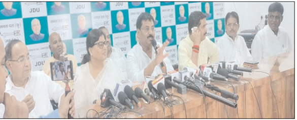
गौडिया को जानकारी देते जदयू के पदाधिकारी।