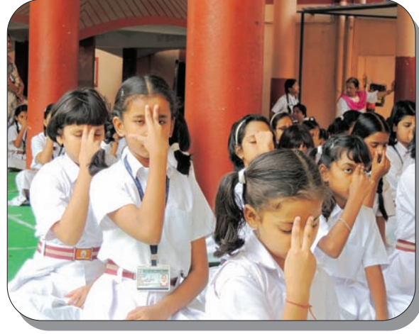
रांची के डीएवी कपिलदेव पब्लिक स्कूल में छात्र-छात्राओं ने किया योग का अभ्यास।

RANCHI : अंतरराष्ट्रीय योग दिवस के अवसर पर शुक्रवार को झारखंड की राजधानी रांची, जमशेदपुर, धनबाद सहित पूरे राज्यभर में योगाभ्यास कार्यक्रम का आयोजन किया गया। अलग-अलग जिलों में जिला प्रशासन के अधिकारियों ने योग कार्यक्रम में हिस्सा लिया। इसके अलावा विभिन्न शैक्षणिक संस्थानों, सामाजिक संगठनों एवं राजनीतिक दलों के कार्यकर्ताओं ने भी योग किया। सामूहिक योग कार्यक्रम का उद्देश्य लोगों को योग अपनाने के प्रति जागरूक करना था। लातेहार, हजारीबाग, सरायकेला-खरसावां में भी व्यापक पैमाने पर योग कार्यक्रम का आयोजन हुआ।