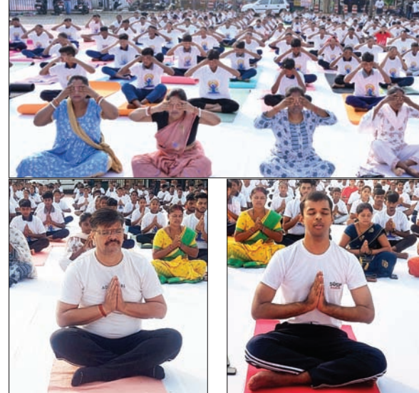
करम टोली तालाब, रांची में जिला प्रशासन एवं पर्यटन, कला, संस्कृति, खेल-कूद एवं युवा कार्य, विभाग रांची की तरफ से अंतरराष्ट्रीय योग दिवस मनाया गया।