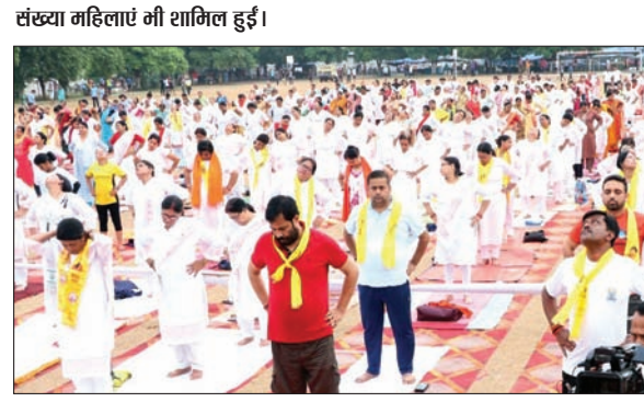
एनिको ट्रांसपोर्ट मैदान में बस्ती विकास समिति के सौजन्य से मना योग दिवस।