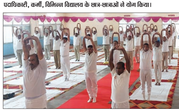
रांची में योग करते आरपीएफ के जवान।