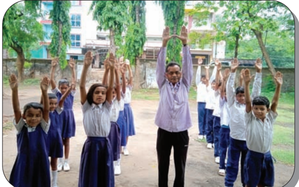
कांड़ा स्थित हरिश्चंद्र विद्या मंदिर में योग करते विद्यार्थी।