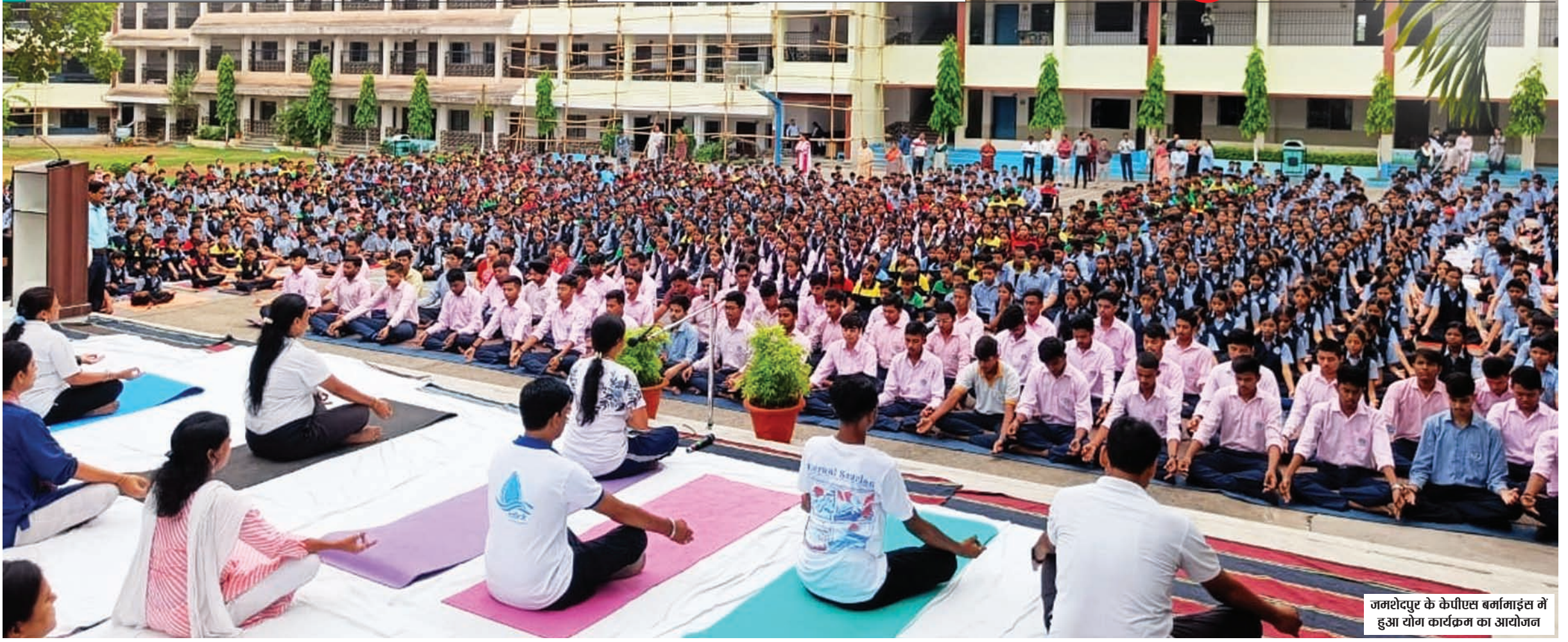
जमशेदपुर के केपीएस बर्मागार्ड में हुआ योग कार्यक्रम का आयोजन