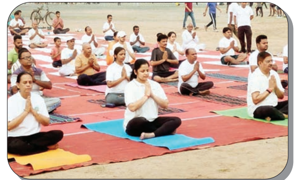
धनबाद स्थित गोल्फ ग्राउंड में शुक्रवार को जिला स्तरीय योग कार्यक्रम हुआ।