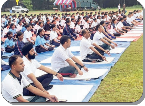
एनएलसी की 37 बटालियन ने जमशेदपुर को-ऑपरेटिव कॉलेज, सिंहम कॉलेज घाटिल, चाईबासा, एसएनएस विद्यामंदिर घाटशिला व ईईसी स्कूल जादूगोड़ा में योग किया।