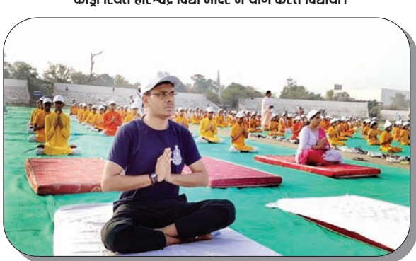
हजारीबाग के कर्जन मैदान में हुआ योगाभ्यास।