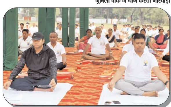
इंडोर स्टेडियम, सरायकेला में उपायुक्त व पुलिस अधीक्षक के साथ जिलास्तरीय पदाधिकारी, कर्मी, विभिन्न विद्यालय के छात्र-छात्राओं ने योग किया।