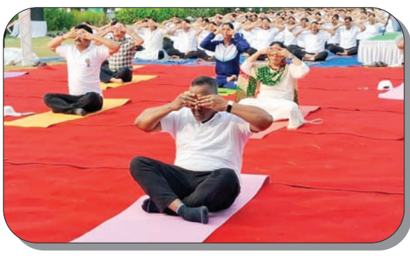
झारखंड सरकार की ओर से बिरसा मुंडा फन पार्क में राजकीय कार्यक्रम हुआ।