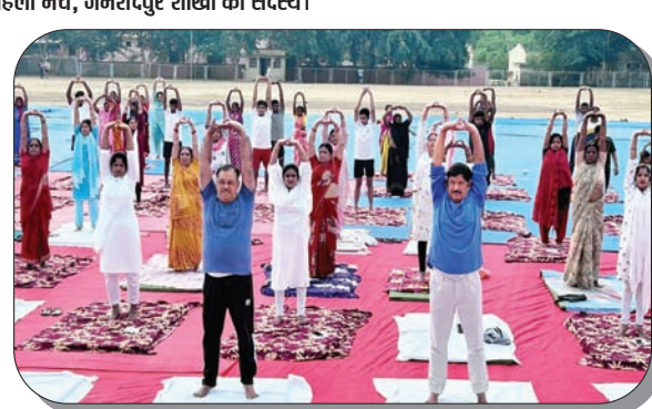
लातेहार के स्टेडियम में योग करते प्रशासनिक पदाधिकारी व कर्मी। इस दौरान बड़ी संख्या महिलाएं भी शामिल हुईं।