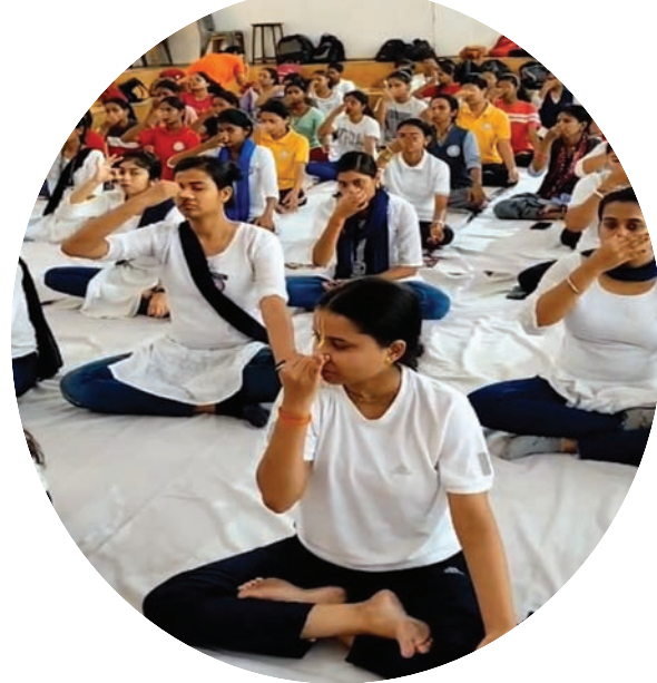
जमशेदपुर महिला विश्वविद्यालय में मना अंतरराष्ट्रीय योग दिवस।