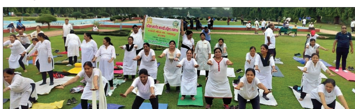
जुबिली पार्क में योग करती मारवाड़ी महिला मंच, जमशेदपुर शाखा की सदस्य।