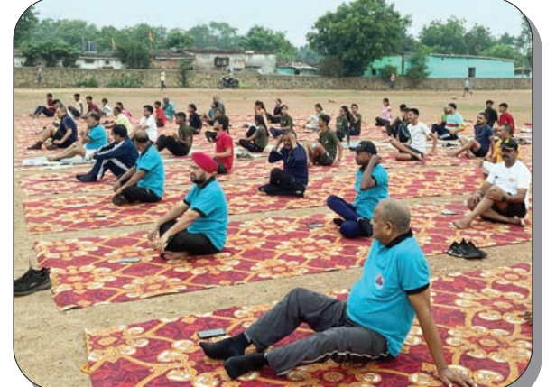
पूर्व सैनिकों ने बागबेड़ा में नवयुग समाज सेवा समिति के साथ योग दिवस मनाया।