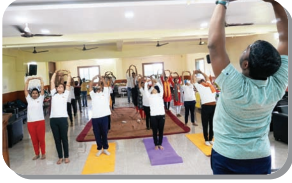
एमबीएनएस ग्रुप ऑफ इंस्टीट्यूट्स ने योग दिवस मनाया।