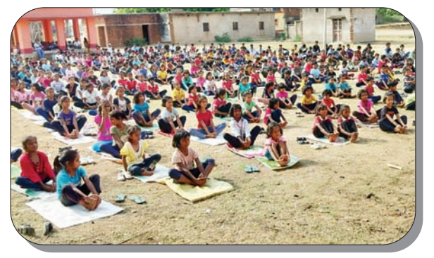
योग दिवस पर कोडरमा और झुमरीतिलैया समेत कई जगहों पर हुए कार्यक्रम।