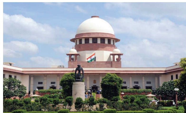
The UGC-NET's cancellation in June further amplifies concerns. The Ministry of Education's suo motu action based on undisclosed inputs from the Union Home

MANY weeks of student trauma later, the Supreme Court verdict on Tuesday finally shut the door on the NEET controversy with a firm rejection of the demand for a re-exam. While the SC decision to avoid a re-test, considering the disruption it would cause to 24 lakh aspirants, is pragmatic, it also highlights deeper issues within our educational and testing systems. Chief Justice DY Chandrachud's observation that the leaks did not constitute a 'systemic breach' provides temporary relief but does little to address the underlying vulnerabilities. The leaks in Hazaribagh and Patna, as per the evidence presented by the National Testing Agency (NTA) and IIT-Delhi question the integrity of an exam critical for aspiring medical professionals. The court's reliance on the NTA to address the affected students' cases reflects a stopgap approach rather than a long-term solution.