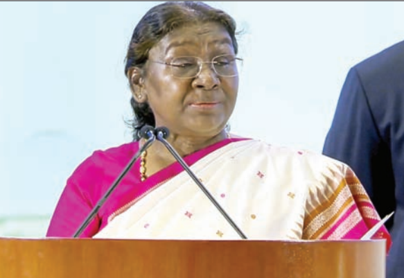
कार्यक्रम को संबोधित करती राष्ट्रपति द्रौपदी मुर्मू

जिला न्यायपालिका के राष्ट्रीय सम्मेलन के समापन समारोह में बोलीं द्रौपदी मुर्मू