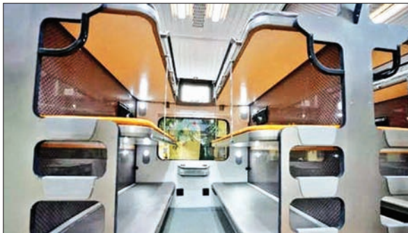
कुछ ऐसे दिखेंगे ट्रेन के डिब्बे

भारतीय रेल द्वारा बहुत जल्द वंदे भारत स्लीपर ट्रेनों का संचालन शुरू किया जाने वाला है। वंदेभारत स्लीपर ट्रेन का निर्माण भी स्वदेशी तकनीक से किया जा रहा है। इसका निरीक्षण करने रविवार को बंगलुरु आए रेल मंत्री अश्विनी वैष्णव ने कहा कि तीन माह बाद वंदे भारत स्लीपर ट्रेन पटरियों पर दौड़ती नजर आएगी। इसमें पैसेंजर सेप्टी के साथ-साथ लोको पायलट और अटेंडेंट की सुविधा का भी पूरा ध्यान रखा गया है। लोको कैब को बेहतर बनाया गया है, साथ ही यह ट्रेन टक्कर रोधी कवच प्रणाली से लैस है। वंदे भारत स्लीपर ट्रेन का डिजाइन और इसका इंटीरियर काफी आकर्षक और इसमें विश्वस्तरीय यात्री सुविधाएं उपलब्ध कराई गई हैं। इस ट्रेन में सुपरसोनी चार्जिंग प्रावधान के साथ एकीकृत रीडिंग लाइट, सार्वजनिक घोषणा और विजुअल इन्फॉर्मेशन प्रणाली, इनसाइड डिस्प्ले पैनल और सिन्योरिटी कैमेरे व मॉड्यूलर