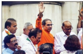
प्रदर्शन करते शरद पवार व उद्धव ठाकरे

MUMBAI (BHASHA) : राष्ट्रवादी कांग्रेस पार्टी-शरदचंद्र पवार (राकांपा-एसपी) प्रमुख शरद पवार और शिवसेना-उद्धव बालासाहेब ठाकरे (शिवसेना-यूबीटी) के नेता उद्धव ठाकरे ने महाराष्ट्र के सिंधुदुर्ग जिले में छत्रपति शिवाजी महाराज की प्रतिमा गिरने के विरोध में दक्षिण मुंबई स्थित हुतात्मा चौक से 'गेटवे ऑफ इंडिया' तक रविवार को 'महा विकास आघाडी' (एमवीए) के मार्च का नेतृत्व किया। एमवीए नेताओं ने प्रतिमा ढहने के लिए केंद्र और राज्य सरकार की आलोचना की। गठबंधन की घटक शिवसेना (यूबीटी) के प्रमुख उद्धव ठाकरे ने कहा कि इस मामले में