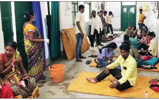
सुरबुड़ा पंचायत के गांव के गोप टोला के वार्ड सदस्य समेत अन्य ग्रामीणों ने बताया कि खराब पड़े जलमीनार तथा चापाकल बनाने के लिए पेयजल एवं स्वच्छता विभाग को आवेदन दिया गया था, लेकिन तीन माह बाद भी पेयजल एवं स्वच्छता विभाग द्वारा कोई कार्रवाई नहीं की गई। इस कारण गांव के लोग पिछले तीन माह से कुएं का दूषित पानी पीने को मजबूर थे।

कुएं का पानी पी रहे थे, लेकिन कुओं का पानी दूषित होने के कारण गांव के ग्रामीण धीरे-धीरे