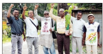
'हुल-गीरा' संताल आदिवासी समाज द्वारा किसी विशेष परिस्थिति में संकट के समय प्रेषित किया जाता है। साल वृक्ष की डाली को संदेशवाहक के रूप में उपयोग किया जाता है। उल्लेखनीय है कि महान संताल विद्रोह 1855 ई० में संताल समाज के नेता अंग्रेजी हुकूमत, महाजनी शोषण-अत्याचार के खिलाफ 'हुल' 30 जून को आहवाहन किया था और 1855 को भोगनाडीह में सभा कर विद्रोह का बिगुल फूँका गया था।