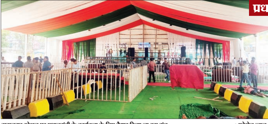
टाटानगर स्टेशन पर प्रधानमंत्री के कार्यक्रम के लिए तैयार किया जा रहा मंच

प्रधानमंत्री नरेंद्र मोदी 15 सितंबर को शहर आ रहे हैं। वे यहां कई महत्वपूर्ण योजनाओं का उद्घाटन करेंगे। प्रधानमंत्री के सबसे प्रमुख कार्यक्रम में टाटानगर स्टेशन से टाटा-पटना वंदे भारत एक्सप्रेस को हरी झंडी दिखाकर रवाना करना शामिल है। इसके साथ ही प्रधानमंत्री वरुंअली झारखंड से होकर गुजरने वाली अन्य पांच वंदे भारत एक्सप्रेस ट्रेनों को भी रवाना करेंगे। इनमें टाटा-ब्रह्मपुर, हावड़ा-टाटानगर-राउरकेला, हावड़ा-धनबाद-गया, वाराणसी-देवघर, और हावड़ा-दुमका-भागलपुर ट्रेन की शुरुआत शामिल है। पीएम के नगरागमन को लेकर जिला प्रशासन चाक-चौबंद सुरक्षा में जुटा है। एसपीजी के निर्देशन में सारी व्यवस्था की जा रही है। इसके तहत जुगसलाई से गोपाल मैदान तक बिष्टुपुर मेन