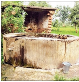
इसी कुएं का पानी पी रहे थे ग्रामीण व इलाजरत मरीज

पश्चिमी सिंहभूम जिले के चक्रधरपुर प्रखंड अंतर्गत सुरबुड़ा पंचायत के गोप टोला में डायरिया फैलने से एक महिला की मौत हो गई थी, जबकि एक दर्जन से ज्यादा लोग बीमार हो गए हैं। सभी का चक्रधरपुर अनुमंडल अस्पताल में इलाज चल रहा है। गांव में डायरिया फैलने का मुख्य कारण दूषित जल बताया जा रहा है। जानकारी के अनुसार, सुरबुड़ा गोप टोला में चार चापकल हैं, लेकिन तीन-चार माह से खराब पड़े हैं। गांव में दो जलमीनार भी हैं, लेकिन वह भी करीब तीन माह से खराब हैं। गांव में स्वच्छ पेयजल का ग्रामीणों के पास कोई साधन नहीं है। चापाकल और जलमीनार खराब होने के बाद गांव के 70 परिवार