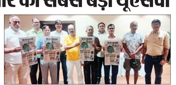
बिजनेस मीट में शामिल हुए विज्ञापन एजेंसियों के संचालक व प्रतिनिधि

दैनिक द्विभाषी समाचार 'द फोटोन न्यूज' की ओर से शुक्रवार को साकची स्थित होटल जीवा में बिजनेस मीट का आयोजन किया गया। इसमें शहर के कई बिजनेस सह विज्ञापन एजेंसियों के संचालक एवं प्रतिनिधि शामिल हुए। कार्यक्रम में 'मां मीडिया वेंचर' की ओर से राजधानी रांची से प्रकाशित व मद्रिद समाचार पत्र तथा पोर्टल 'द फोटोन न्यूज' परिवार के सदस्यों ने इस मीडिया हाउस की शुरुआत, उद्देश्य, खबरों के चयन, बाइलिंगुअल समाचार पत्र के प्रकाशन समेत भविष्य की योजनाओं आदि की जानकारी दी। उन्होंने बताया कि जन्हित, समाज, राज्य व देशहित के सरोकार को ध्यान में रखते हुए इस समाचार पत्र व पोर्टल की शुरुआत की गई है।