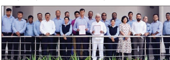
समझौते की प्रति दिखाते कंपनी व युनियन के पदाधिकारी