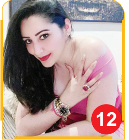
Sanjay Dutt And Maanayata...