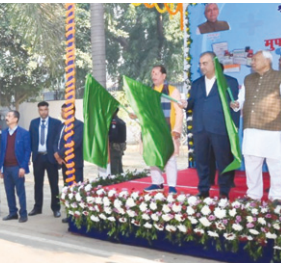
हरी झंडी दिखाकर रथ को रवाना करते सीएम नीतीश व अन्य।