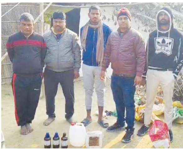
पुलिस गिरफ्तार में तस्कर।

उत्तर प्रदेश के प्रयागराज में दिव्य और भव्य महाकुंभ 2025 का आयोजन किया जाएगा। बिहार के मुख्यमंत्री नीतीश कुमार को यूपी के सीएम योगी आदित्यनाथ ने न्योता भेजा है। बिहार के मुख्यमंत्री नीतीश कुमार, डिप्टी सीएम सम्राट चौधरी, विजय सिन्हा सहित बिहार सरकार के अन्य मंत्रियों को भी महाकुंभ में शामिल होने के लिए न्योता भेजा गया है। मुख्यमंत्री नीतीश कुमार से उत्तर प्रदेश के दो मंत्रियों ने आज मुलाकात की। उत्तर प्रदेश के सूक्ष्म लघु एवं मध्यम उद्यम खादी एवं ग्रामीण उद्योग मंत्री राकेश सचान और राज्य मंत्री स्वतंत्र प्रभार दयाशंकर सिंह ने शिष्टाचार मुलाकात की है। इस दौरान योगी सरकार के मंत्रियों ने महाकुंभ में आने के लिए उन्हें निमंत्रण पत्र भी सौंपा। योगी सरकार में मंत्री दयाशंकर सिंह ने कहा है कि महाकुंभ के निमंत्रण को मुख्यमंत्री नीतीश कुमार ने स्वीकार किया है। उन्होंने कहा है कि वह महाकुंभ