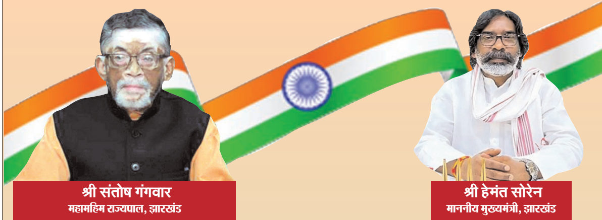
श्री संतोष गंगवार महामहिम राज्यपाल, झारखंड