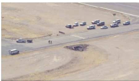
singer Vince Neil after the aircraft veered off a runway in Scottsdale and hit a business jet. Four major aviation disasters have occurred in North America in the last month.

World. A midair collision involving two small planes in southern Arizona killed at least two people Wednesday morning, authorities said.