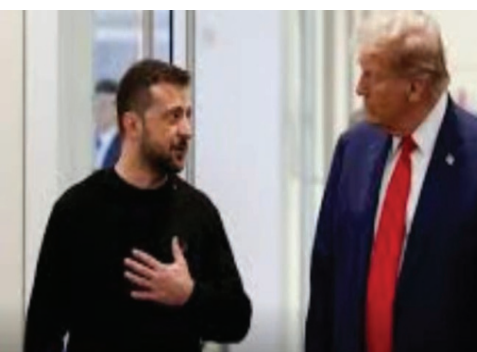
of its mineral reserves to the US as repayment. Ukraine is home to $12 trillion worth of natural resources — including lithium, a mineral vital for modern technology. However, President Zelensky has strongly opposed the idea, viewing it as an unfair demand.

Best-Case Scenario: A stable ceasefire, enforced by European peacekeepers, preventing Russia from further advancing westward. Worst-Case Scenario: A fractured Ukraine, with Russia consolidating power in occupied territories and potentially pushing further into Ukrainian land in the future.