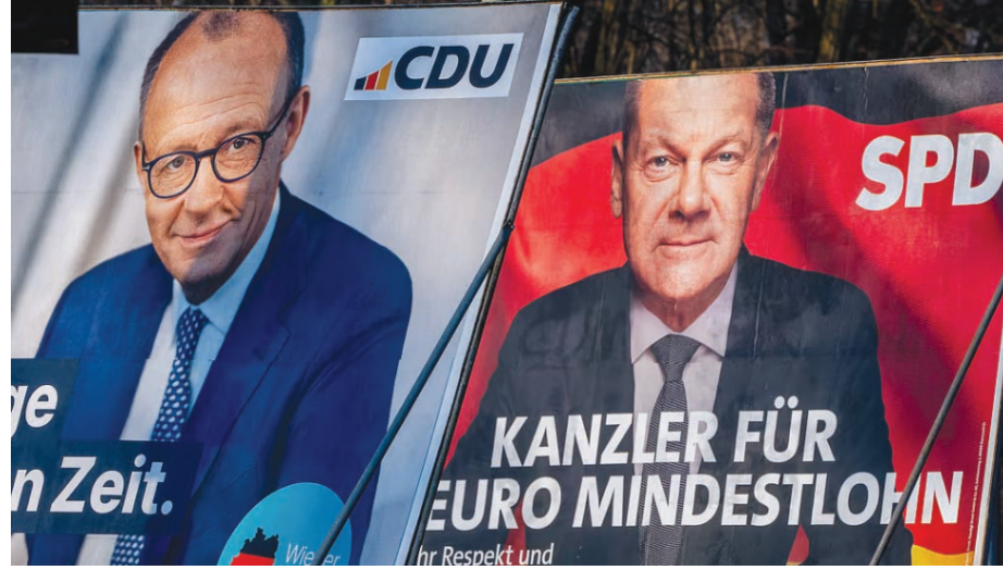
voting ends, and the general picture of the outcome should be clear very quickly. A final official result is expected early Monday.

Polls are due to open at 8 a.m. and close at 6 p.m. Germans can also vote by postal ballot, but their ballot must arrive by the time polling stations close on election day to be counted.