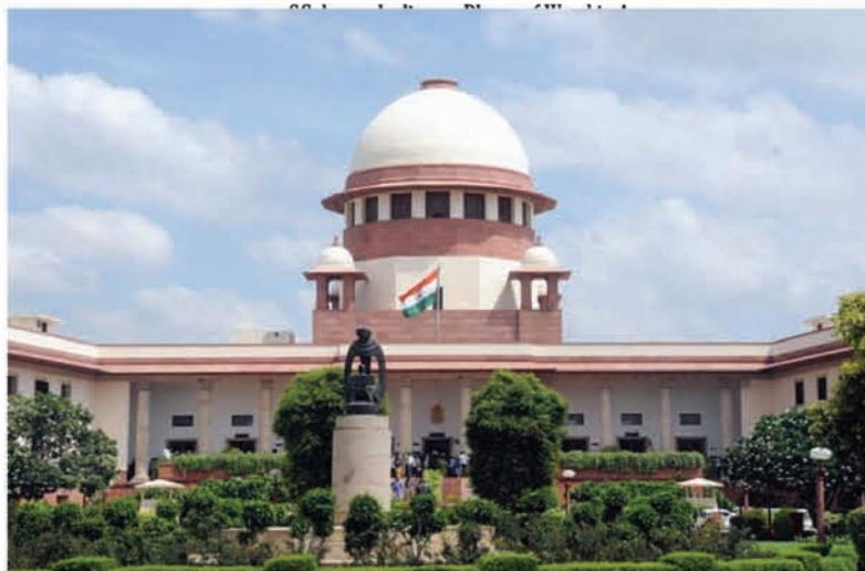
Yet, fresh petitions continue to pour in, prompting Chief Justice Sanjiv Khanna to declare, "Enough is enough."

The Supreme Court's recent rebuke for the flood of petitions concerning the Places of Worship (Special Provisions) Act, 1991, highlights the growing politicisation of religious disputes. The Act, introduced during the PV Narasimha Rao government, was meant to prevent further communal discord by freezing the religious character of places of worship as of August 15, 1947, with the sole exception of the Ram Janmabhoomi-Babri Masjid dispute. However, it now finds itself at the centre of legal and political manoeuvring. The SC's frustration is understandable. The surge of intervention applications, many filed by political leaders and organisations, reflects an unsettling trend — using the judiciary as a battleground for religious and electoral gains. On December 12, 2024, the SC had already issued an interim order restraining lower courts from entertaining fresh suits or ordering surveys concerning religious sites.