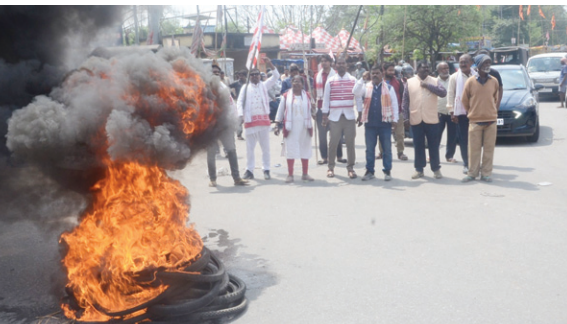
PHOTON NEWS RANCHI : सिरमटोली फ्लाईओवर के रैंप निर्माण को लेकर शुरू हुआ विवाद अब व्यापक रूप ले चुका है।

आम लोगों के साथ-साथ वीआईपी को भी झेलनी पड़ी दिक्कत अरगोड़ा, लोवाडीह, रातू के तिलता, पंडरा महावीर मंदिर सहित कई जगहों पर टायर जलाकर किया गया प्रदर्शन सड़कों पर कम दिखे वाहन आँटो परिवचालन भी रूठा बंद