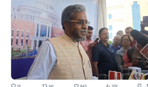
जमना की सुरक्षा और शांति के लिए ऐसे अपराधियों पर कठोर कार्रवाई आवश्यक है। पुलिस प्रशासन को इसी दृष्टि से अपनी कार्रवाई जारी रखनी चाहिए।