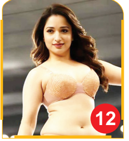
Tamannaah Bhatia's Odela 2 Gets A...