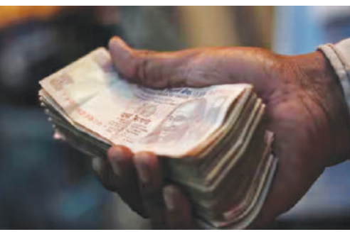
Amount for opening of account and maximum balance that can be retained

beginning of a fiscal year, you will reap maximum interest on your Public Provident Fund. Conversely, if you are a subscriber of Public Provident Fund, March 31 deadline is also equally significant for you. The Minimum