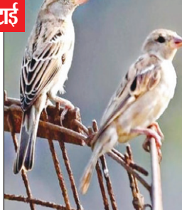
जलवायु परिवर्तन के कारण उपयुक्त हवा, पानी व भोजन की कम हो रही उपलब्धता

इंटरनेशनल जर्नल ऑफ एग्रिकल्चरल साइंस के मुताबिक पंजाब, हरियाणा, पश्चिम बंगाल, बिहार, मध्य प्रदेश समेत कई राज्यों, शहरों और यहां तक की ग्रामीण क्षेत्रों में पक्षी विज्ञानियों ने गौरैया की आबादी में बहुत तेजी से गिरावट देखी है। आईसीएआर के मुताबिक भारत के तटीय क्षेत्रों में गौरैया की आबादी 70 से 80 फीसदी घट गई है। इसका प्रमुख कारण है तेजी से बढ़ता शहरीकरण, आधुनिक निर्माण शैली और पेड़ों की कटाई के कारण गौरैया के लिए घोंसला बनाने की जगहें कम हो रही हैं।