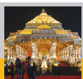
प्रधानमंत्री नरेंद्र मोदी की अध्यक्षता में 2024 में रामलला की हुई थी प्राण-प्रतिष्ठा