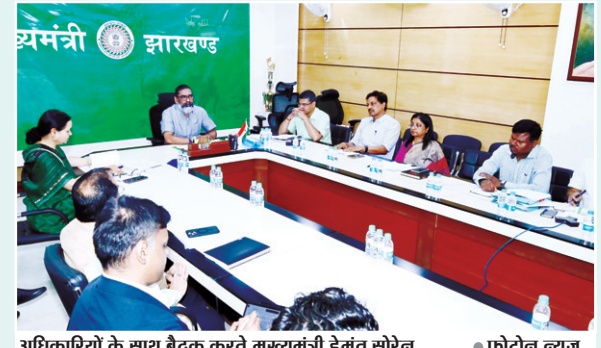
अधिकारियों के साथ बैठक करते मुख्यमंत्री हेमंत सोरेन

» सभी मेडिकल कॉलेजों व देवघर स्थित एम्स अस्पताल में हेलीपैड बनाने की करें पहल