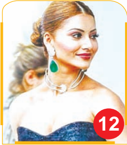
Urvashi Rautela Reveals What It Takes...