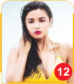
Alia Bhatt Steps Out After Gym...