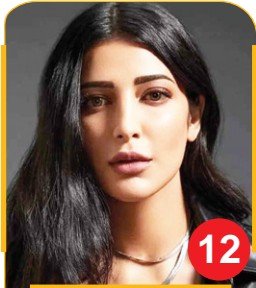
Shruti Haasan Stopped By...