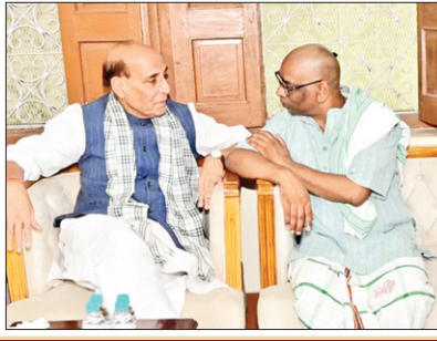
हेमंत ने दशकर्म की परंपरा का किया निर्वहन, मुंडवाया सिर

केंद्रीय रक्षा मंत्री राजनाथ सिंह ने कहा कि दिशोम गुरु शिवू सोरेन से मेरी कई मुलाकातें हुईं। उनकी सहजता, सरलता एवं व्यक्तिगत मुझे प्रभावित करती थी। गुरुजी सिर्फ आदिवासी ही नहीं, बल्कि अन्य समाज के भी अभिभावक के रूप में जाने जाते थे। मैं अपनी ओर से उन्हें विनम्र श्रद्धांजलि अर्पित करता हूँ। केंद्रीय रक्षा मंत्री राजनाथ सिंह ने दिशोम गुरु शिवू सोरेन की तस्वीर पर पुष्प अर्पित कर उन्हें भावपूर्ण श्रद्धांजलि दी और मुख्यमंत्री एवं उनके परिवारिक सदस्यों से मुलाकात कर अपनी गहरी संवेदनाएं व्यक्त की।